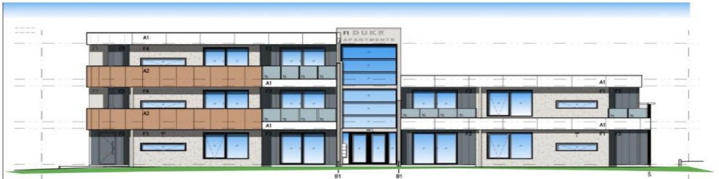
EAST ELEVATION 1:120 As Viewed from Title Boundary